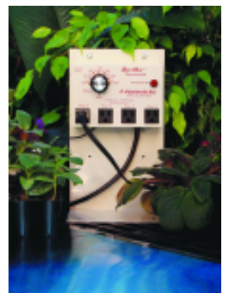
Redi-Heat Thermostat & Propagation Mats

If you have questions or comments please call Phytotronics at 314-770-0717