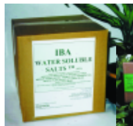
IBA Water Soluble Salts