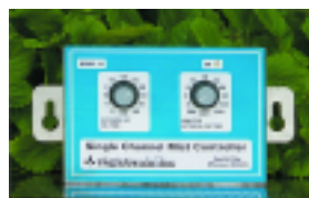
1A Single Zone