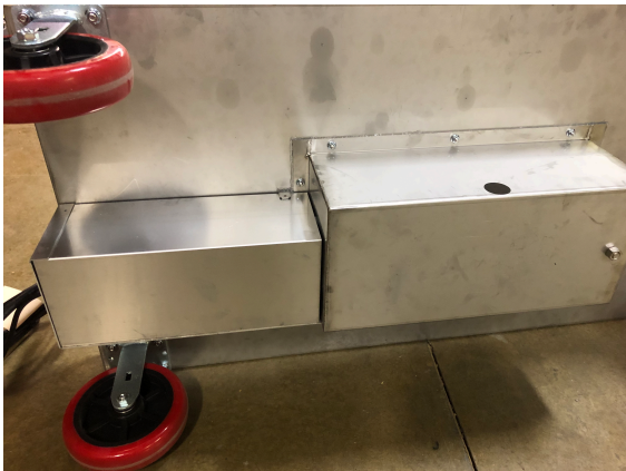
Electrical Box Cover on the left. Water Reservoir on the right with drain plug nut visible.

Lay Germination Chamber on its side. Remove 7 Phillips head screws that hold the electrical box cover in place.