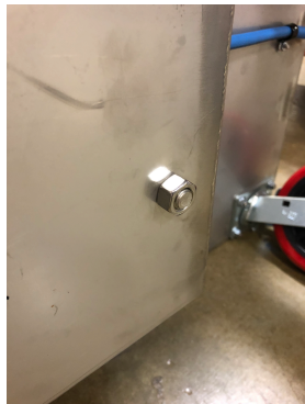
Drain nut outside bottom of water reservoir.

Drain water reservoir by removing the bolt/nut/washer on the bottom. Completely dry reservoir inside and out.